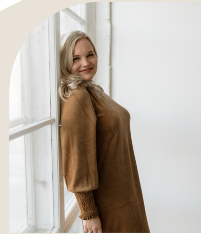
1. Seattle dress

The autumn collection was released at the end of August, when the days were bright and the evenings warm. Now we all can feel the approach of winter. At House of Lola, we also want to live with the spirit of the seasons, so it is time to complete the collection with cozy and maybe even a bit glamorous garments to dress your winter.