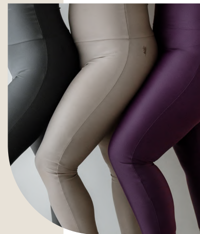
4. Ice leggings