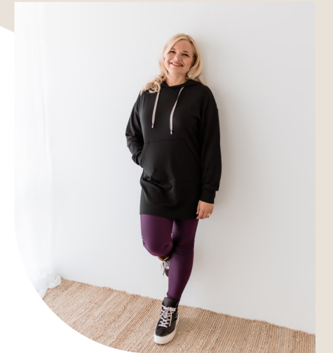
2. Nickan hoodie