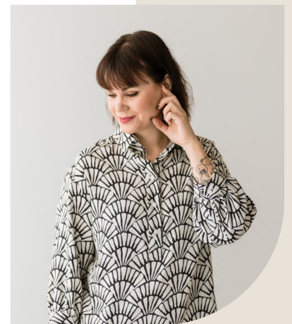
3. Aurora blouse